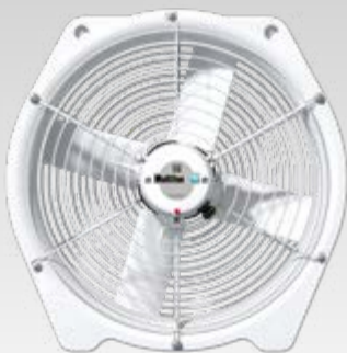
45 cm Greenhouse Fan