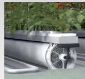
Simple to attach air hoses